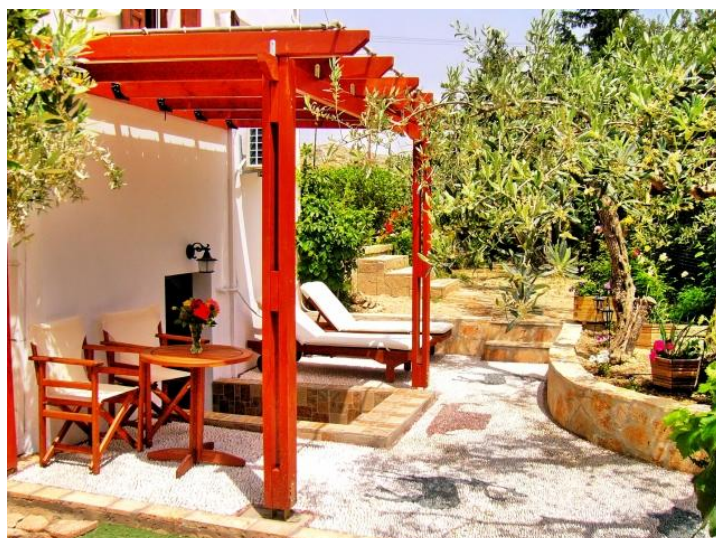
OUTDOOR DINING FURNITURE