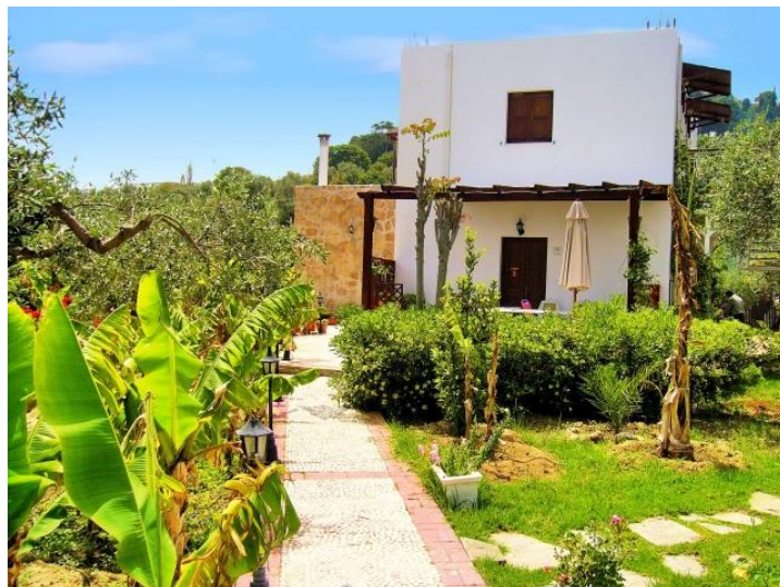
VILLA GALINI - ENTRANCE