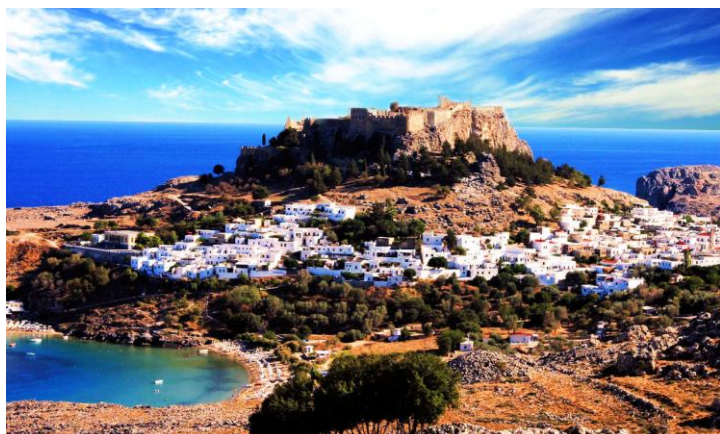
ACROPOLIS OF LINDOS