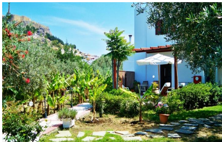
VILLA GALINI - GARDEN