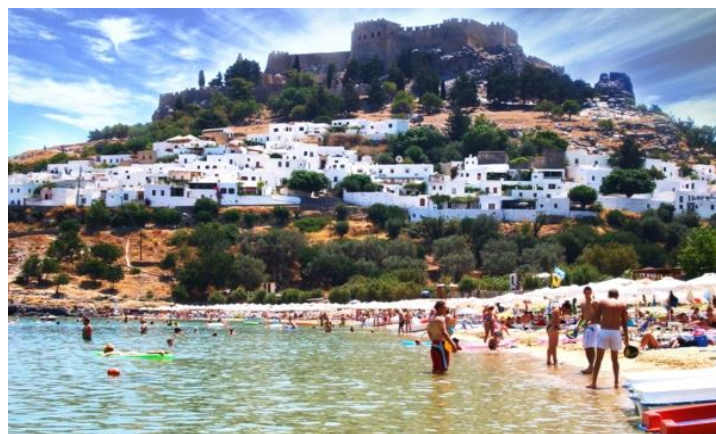
MAIN BEACH OF LINDOS