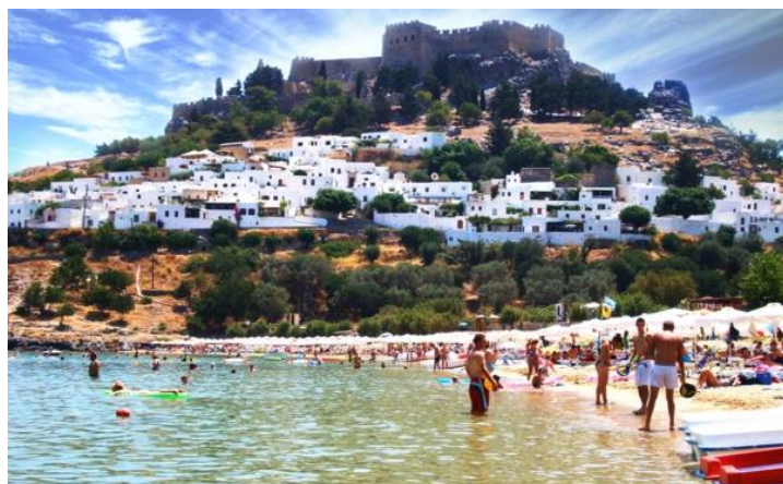
MAIN BEACH OF LINDOS