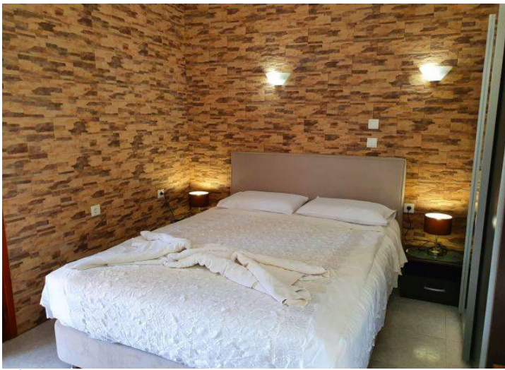
1 st BEDROOM