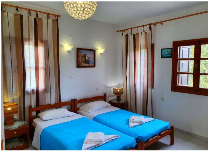
2 nd BEDROOM