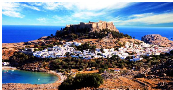
VILLAGE OF LINDOS