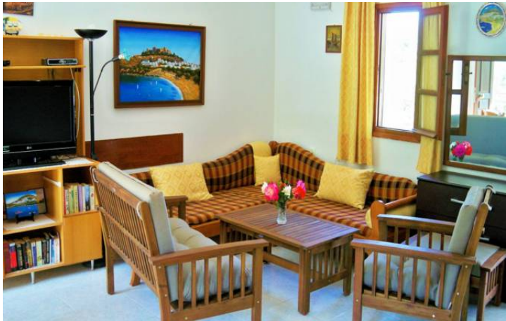
DINING ROOM - FLAT SCREEN LCD TV