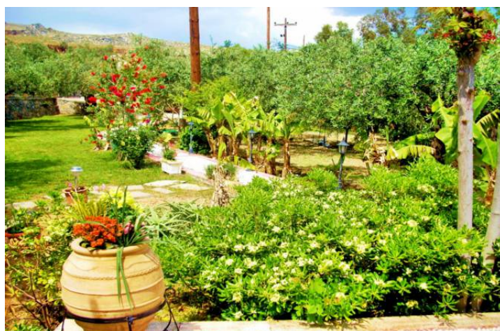
BALCONY – ACROPOLIS VIEW