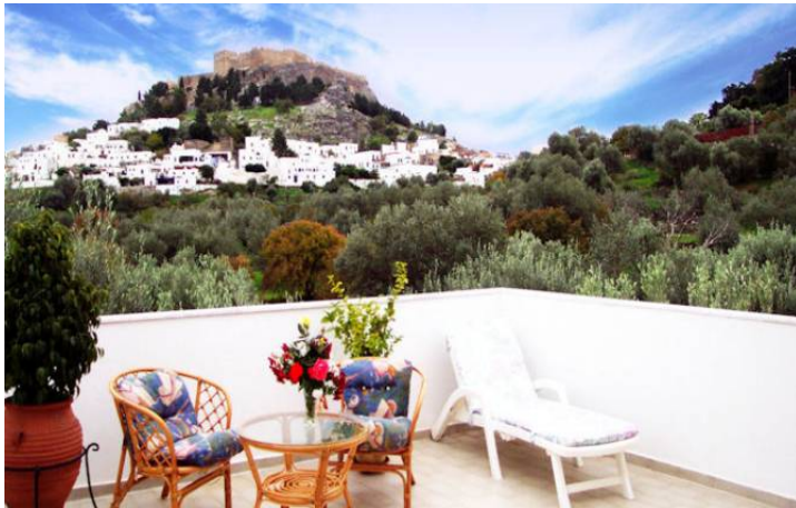
BALCONY – ACROPOLIS VIEW