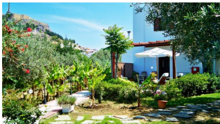
VILLA GALINI - GARDEN